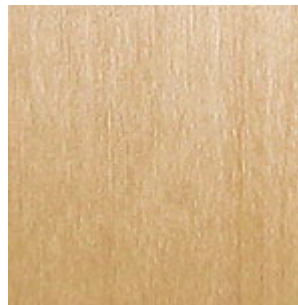
UNIFORM WHITE BIRCH